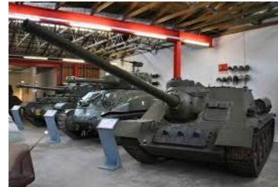
Panzer Museum, Munster

Emergency medical/sickness, missed connections, baggage loss/delay, worldwide travel assistance insurance coverage and cancellation/trip interruption insurance coverage with Travelex is made available to all participants within the U.S. and Canada. We strongly recommend this coverage.