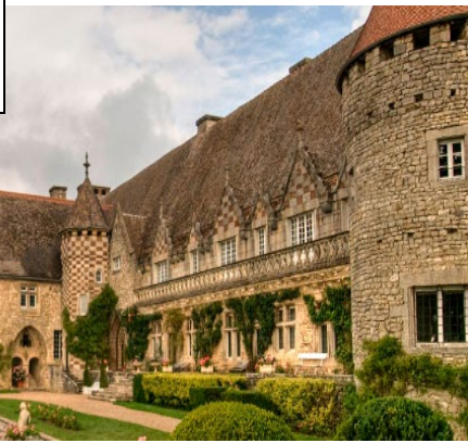
We will spend four nights at the Hattonchatel Chateau, outside of Verdun.