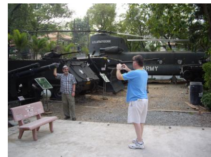
2010 group at war relic's museum, Saigon

A visa is required for Vietnam. You can apply online for this visa by going to www.etvietnam.org for a cost of $25.00. If you do not have access to internet, Valor Tours can obtain a visa on your behalf at our local Vietnam Consulate for $100 per person including visa fee. All we need is a simple form filled out which we will send you, and a copy of your passport.