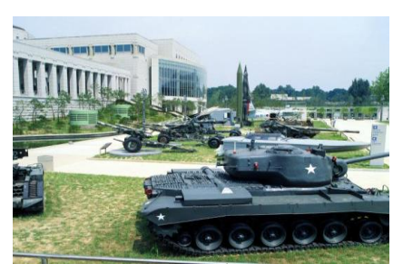
War Memorial in South Korea