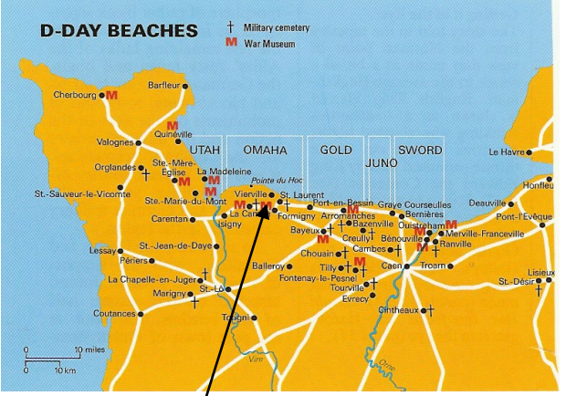
Location of hotel

The personally guided tour packages listed below are subject to availability. Call Valor Tours, Ltd. with your preferred dates and we will respond within 5 working days. A 20% deposit will be due at that time. Final payment due 30 days before arrival in Bayeux. Cancellations received up to 30 days prior to arrival date fully refundable; cancellations received within 30 days of arrival dates subject to 20% cancellation penalty. "No shows" non refundable. Not included in independent packages are cancellation/travel insurance (available upon request), transportation to/from Bayeux, lunches and dinners, and items of a personal nature such as laundry, bar drinks and phone calls and entrance fees to museums.