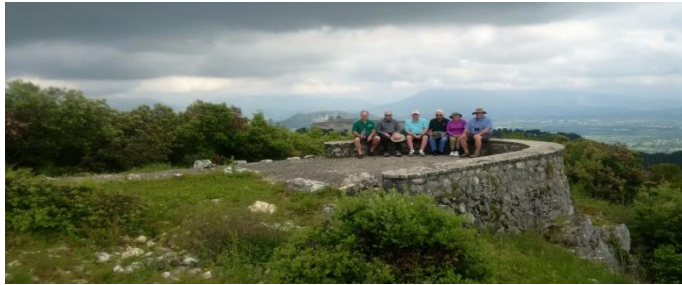
Valor Tours group at Monte Cassino

Drive into the Liri Valley and study the XIII (British) Corps plan to cross the Rapido river in the Fourth Battle of Cassino before pushing on to the Hitler Line to look at the 1 (Canadian) Corps plan to breach the next defensive line on the road to Rome. Drive to Anzio stopping on the way at the impressive Piana delle Orme Museum. Dinner and overnight at the Grand Hotel dei Cesari.