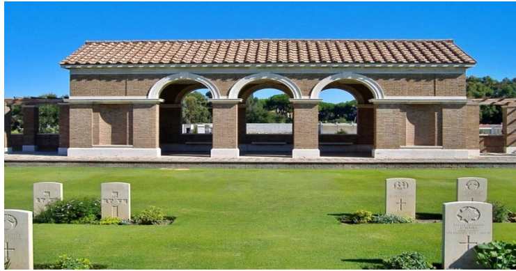
Anzio War Cemetery

The day will be spent north of Rome looking out how Fifth Army advanced in the face of light German opposition but unable to capitalize on this advantage for lack of manpower. Earlier promises to mount Op DRAGOON in Southern France with seasoned American and French troops from Italy were now impacting Fifth Army progress. Dinner and overnight at the Antico Podere San France.