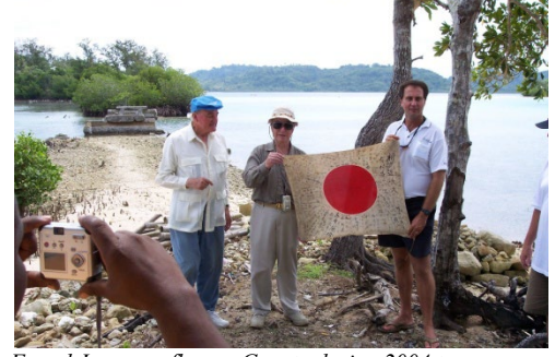
Found Japanese flag on Gavutu during 2004 tour