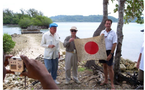
Found Japanese flag on Gavutu during 2004 tour