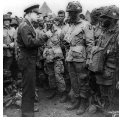
Dwight Eisenhower giving orders to American paratroopers in England on June 6, 1944

Additional nights in Paris $125.00 per night per person twin share, incl. taxes. $250.00 single occupancy. Individual transfers will be arranged from the airport to our hotel in Paris located in the Opera district.