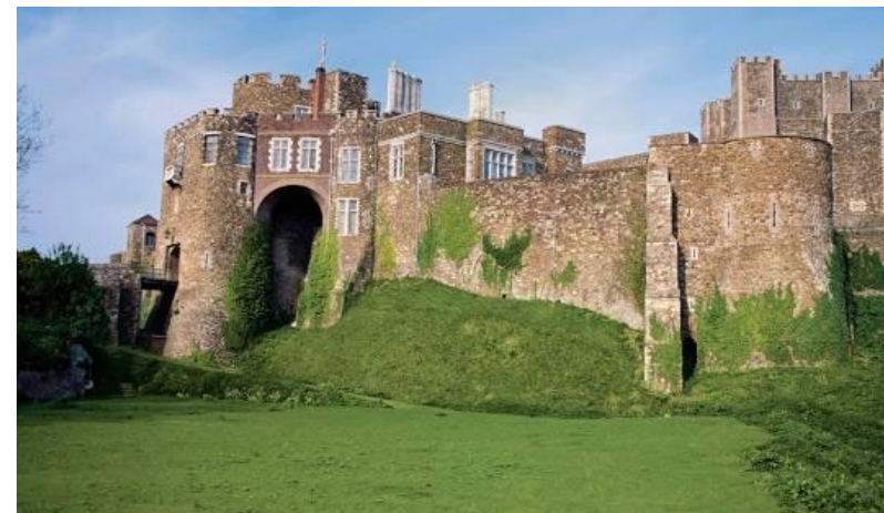
The Napoleonic tunnels at Dover Castle on the English Channel have a new role as naval and later combined services headquarters, where the Dunkirk evacuation is masterminded. Air attacks earn the area around Dover the Nickname "Hellfire Corner".

Tour cost $4500 per person, twin share. Single supplement $1200. Not including air fare from USA to UK.