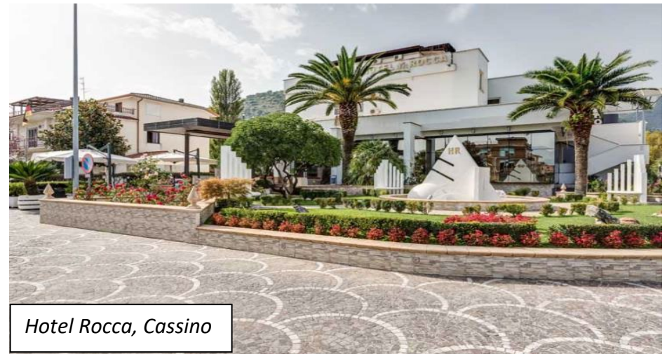
Hotel Rocca, Cassino

Wish to stay in Rome longer? Not a problem. Just let us know.