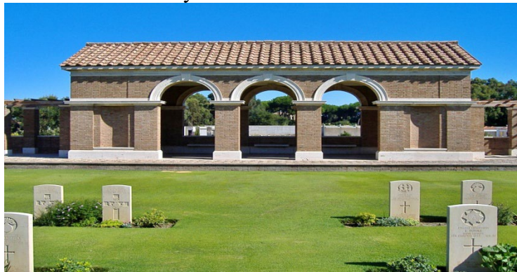
Anzio War Cemetery

After breakfast at hotel, depart for the US Sicily-Rome Military Cemetery. Today study the challenges of Op Shingle landings at Anzio in January 1944. After lunch stop, Smelly Farm, Sunken Road and Campoleone Station. Anzio War Cemetery.