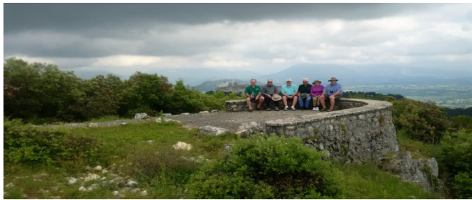
Previous group at Monte Cassino.