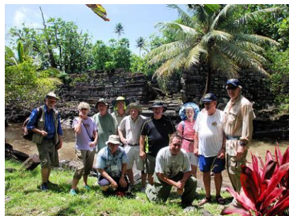
Left: Truk's Eten Island, carved by the Japanese to look like an aircraft carrier. Right: 2013 group at Nan Madol, Pohnpei. Above: Rock Islands from Koror to Peleliu.